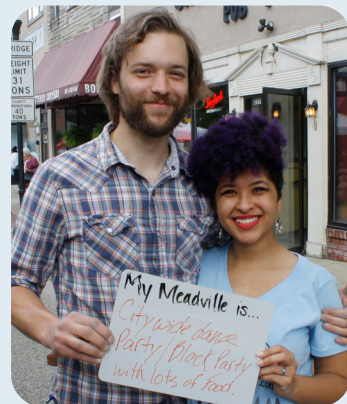
Meadville Heart & Soul, Pennsylvania