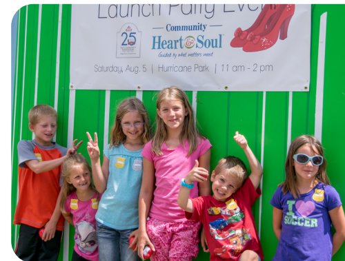
Mt. Blanchard Heart & Soul, Ohio